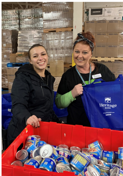
Volunteers at Spring Break Bags prepared 2,000 bags for Pierce County students!

Students experiencing food insecurity don't just need food during break – they need food they can prepare and access themselves. We need your help to collect kid-friendly items for our Break Bags Program that students in the Tacoma and Clover Park School Districts, can safely eat and prepare while their parents are at work. EFN is proud to provide Break Bags to the community in partnership with St. Leo's Food Connection.