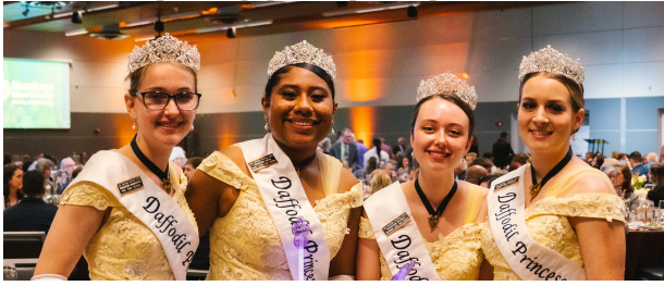
Daffodil Princesses at Abundance 2022

Last year was a busy year for EFN and our network of over 75 partner food pantries, meal sites, and shelters. Our network served over 2 million visits throughout the county from children, adults, and seniors experiencing food insecurity. Throughout 2022, supporters like you joined with EFN and our Partner Programs to achieve our vision of a community where people have access to food where and when they need it. Looking back on the past year, some moments stand out as worth celebrating: