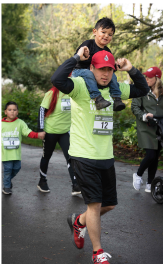
Hunger Walk is for the whole family!

Did you make a New Year's resolution to move more or get involved in your community in 2023? EFN's Hunger Walk is the perfect opportunity to do both, whether or not you made a resolution this year!