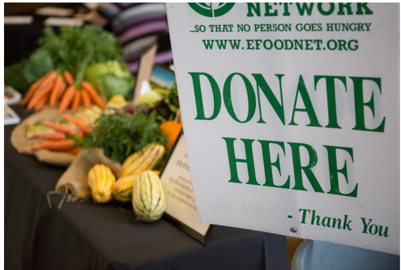
The need for donations is increasing in Pierce County

SNAP benefits create jobs and access to food for families. -Moody's Analytics