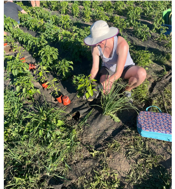
Peppers being planted at Mother Earth Farm.