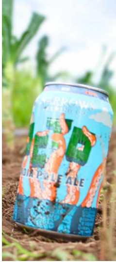
Good times grow at Brewers Night!

Summer has arrived, which means that we are in our peak season at EFN's Mother Earth Farm! We are excited about all of the new things that are in the ground right now including fava beans, radishes, collards, fennel, and tomatoes!